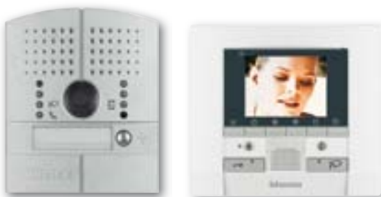
(3.5" colour display)