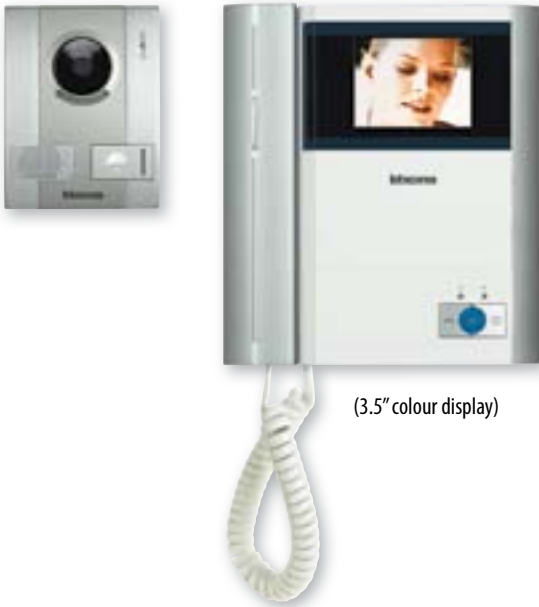
(3.5" colour display)