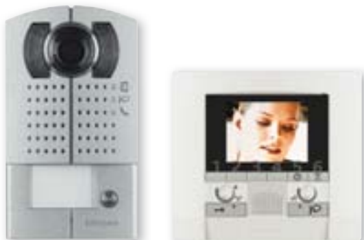
(3.5" colour display)