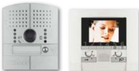
(3.5" colour display)