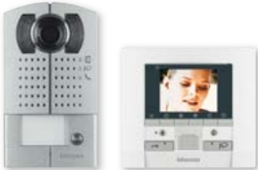
(3.5" colour display)