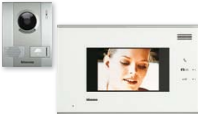
(7" colour display)